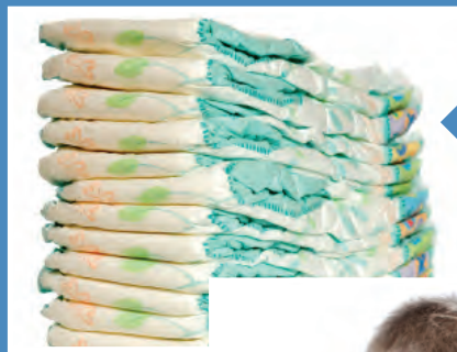
Size 3-6 diapers

Here are items that we could use. Items can be delivered to the office or arranged to be picked up.