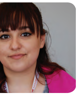
2016 - Gill approves the largest case in its history: jaw surgery for