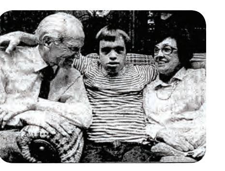
1984 - Gill requests help from the community as the Gill estate funds will be spent by 1988.